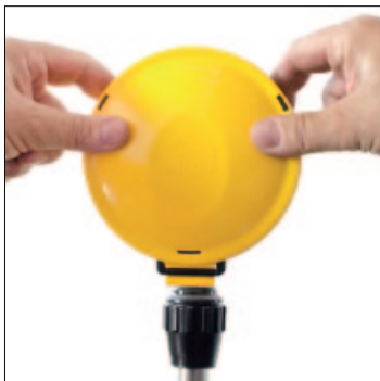
Easy opening. No tool required.