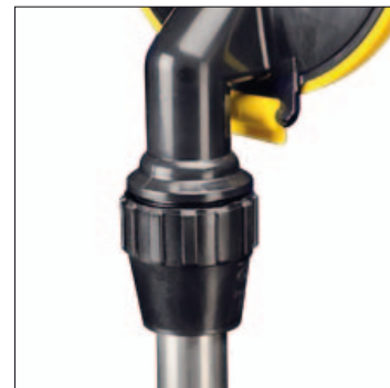
Fast down pipe connection.

With VRH-3 and VRH-3D the installation and handling are the most plug and play possible to provide the farmer with secure functioning.