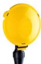
VRH-3 / VRH-3D

Used in farrowing, gestation, weaning and finishing.